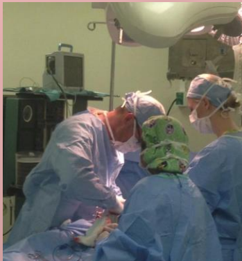
An operation during MMO's surgical trip to Honduras in 2014.

surgical trip at this point, so I can be an asset in future surgical trips in Honduras. Please pray for safety and wisdom in the many decisions involved in such a trip. Four of my brothers are going as well, and I can't wait to introduce them to Team Honduras!