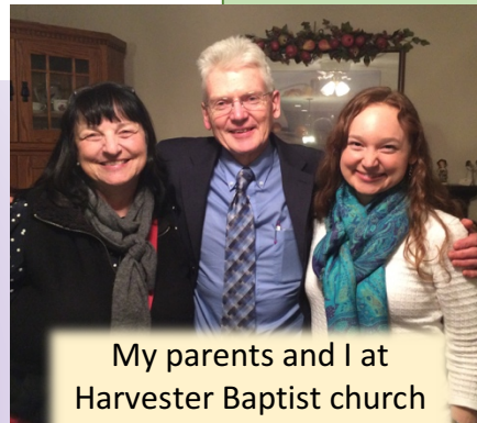
My parents and I at Harvester Baptist church in Ellicott City, MD.

I have recently begun discipling two women from my church on a weekly basis. What a blessing to watch these ladies grow in Christ and in their understanding and application of the Scriptures. Also, when I am in the Baltimore area, I have enjoyed helping out in Rosedale Baptist' sewing , medical, interpreting, nursery, and other ministries. Keeps me busy!