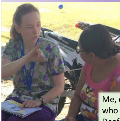
Me, explaining who Jesus is to a Deaf Honduran.

(Honduran sign language) vocabulary: A local Deaf woman came to the clinic and I had the chance to witness to her! See the blog on my website: "Honduras Missions Trip."