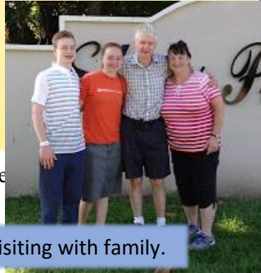
Visiting with family.

NEW HOME : My new home is within walking distance of where I lived during my first 6 months in Honduras. (See my August Blog: Housing Update on my website below.) I have enjoyed going back and visiting several times since moving, and am so grateful for everything I learned there. I am now renting a house (small town-house size) in the same neighborhood, and was able to outfit it with appliances and furniture and all the little necessities of a home, thanks to the many who donated to my start-up fund last year. It has a beautiful view of nearby mountains, and I was especially excited about the living room space – I’ve used it for several Bible studies with locals already!