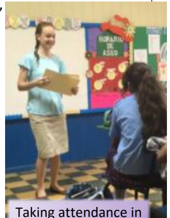
Taking attendance in 6 th grade.

A local bilingual school has requested an English-speaking Bible teacher to come weekly from our church. Our pastor and Bible institute students have been filling this position for several years, and I was asked to help fill a need for the 6 th , 7 th , & 8 th grade classrooms. It has been a wonderful opportunity to lay a firm foundation for the Gospel on a weekly basis. These bilingual teens are mostly from “religious” homes, but have minimal Bible knowledge. Please pray for wisdom as I teach these teens. I look forward to using the experience I gain here to evangelize in a local deaf school next year.