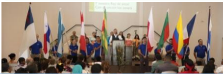
Flags representing foreign missions that our church financially supports.