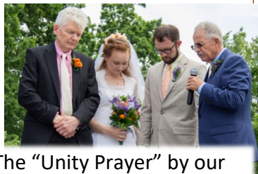
The "Unity Prayer" by our fathers during the wedding.