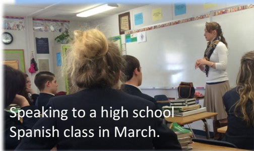
Speaking to a high school Spanish class in March.

Candidacy School II is coming up! June 5-11 will be the second (and final) week of BIMl training that I will receive before heading to Honduras (Lord willing, between October, 2016 and January, 2017). Please pray that I will learn – and retain! – the important information provided.