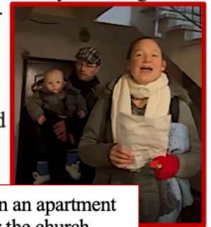
Caroling in an apartment block near the church.